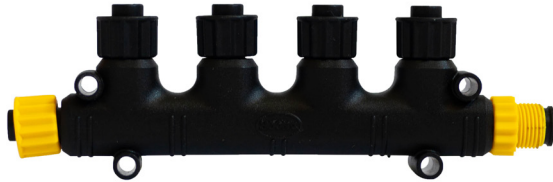
4-port expansion bar